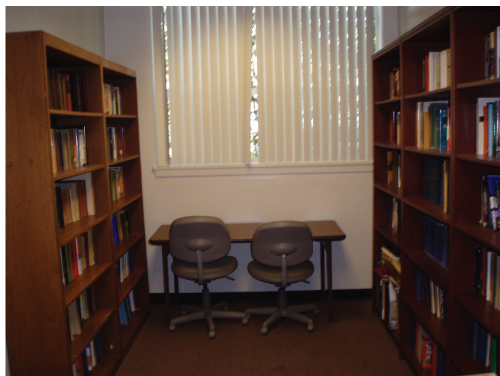
The Rose Institute Leroy Hardy Library