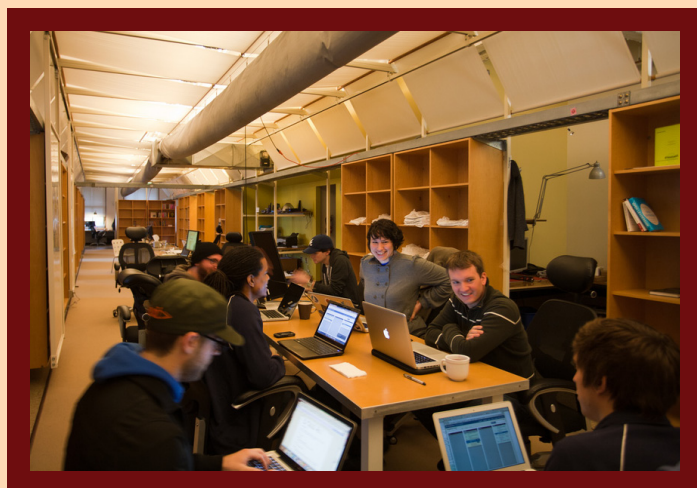
Office at Code for America