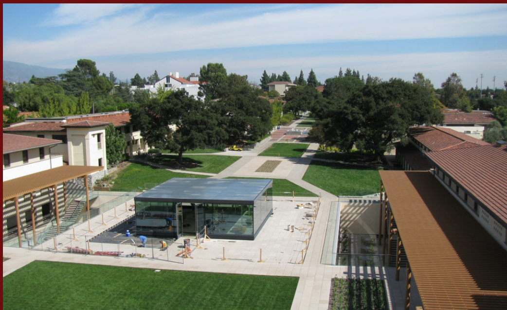
View from the Student Workroom