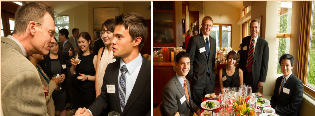
Rose Students attend the award ceremony