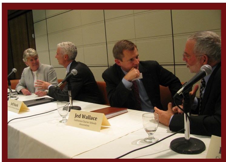
Education Panel discusses California's Education System

In addition to bringing these speakers to the entire Claremont McKenna community at the Athenaeum, each speaker also met with Rose students in the Kravis Center. Prior to each event, Rose students read suggested materials and formulated questions on the given topics. The speaker series has been very engaging and has worked to spark interest in many policy areas, as well as contributing to the discussion of state and local government issues on campus.