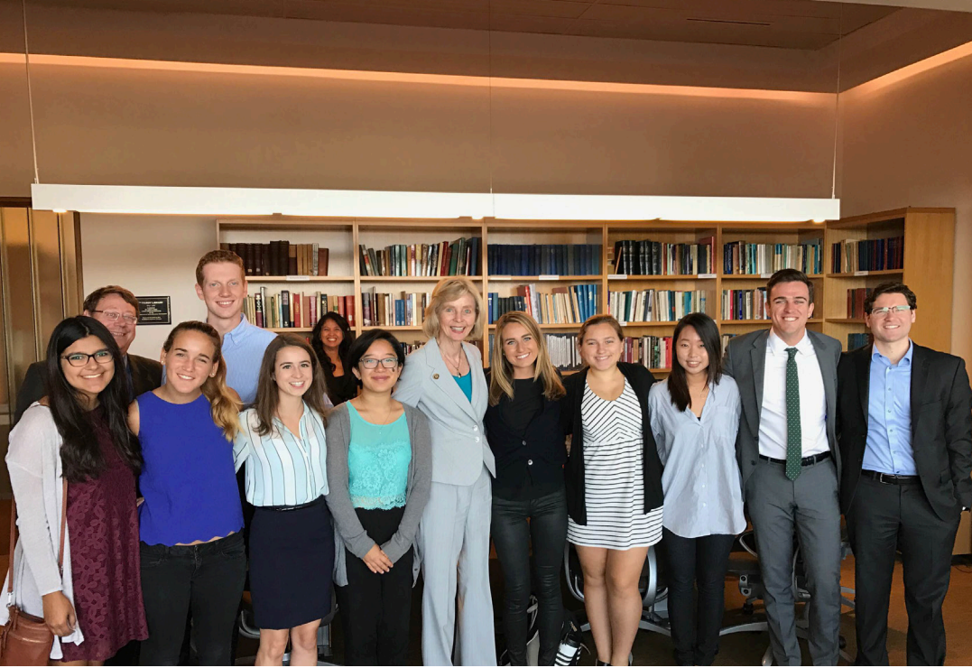
Congresswoman Lois Capps with the Rose student staff