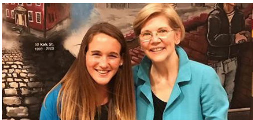
Bryn and Senator Warren